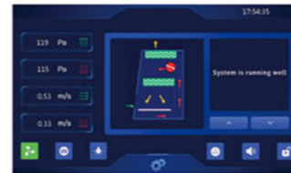
Color Touch Screen Touch operation, real-time and clearer display of various values and appointment timing function.