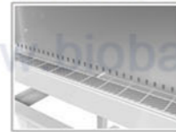
Anti-paper dust structure