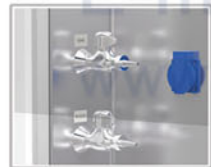
SS Water tap & Gas tap